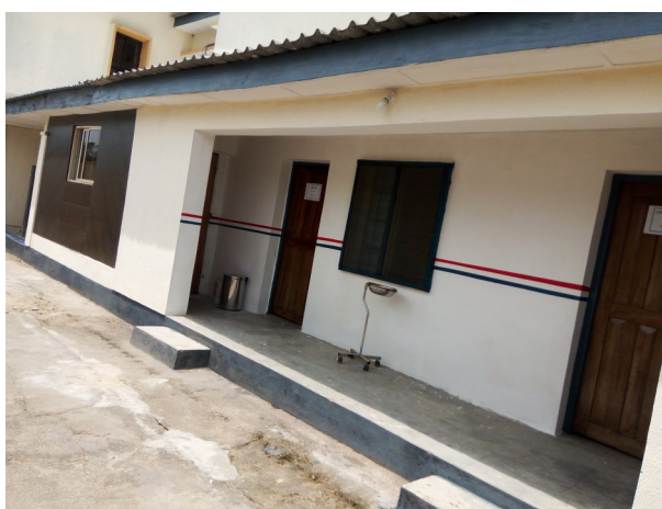
Outside view of the centre.