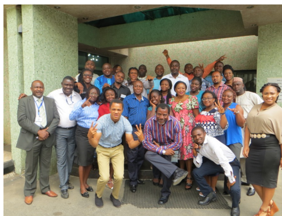
Everybody at the meeting, well, except the person who took the picture.