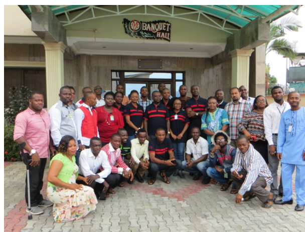
Participants at the training in Eket, Akwa Ibom state.