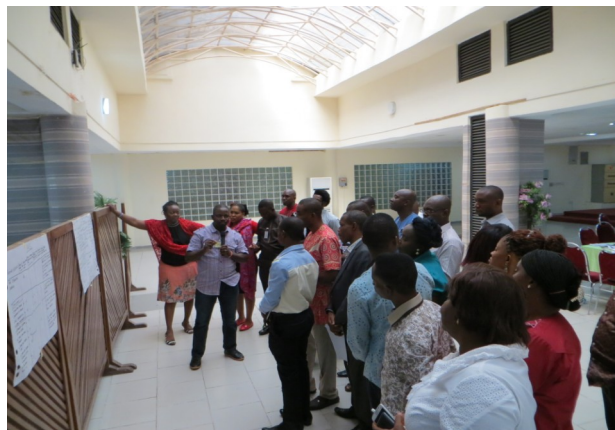
One of the groups presenting their work during the training.

The training was interactive and participatory, with a combination of presentations, plenary discussions, group exercises and role plays used as training methodology. At the end of the training, participants’ gave feed back and state-specific action plans were developed to facilitate achievement of training outcomes.