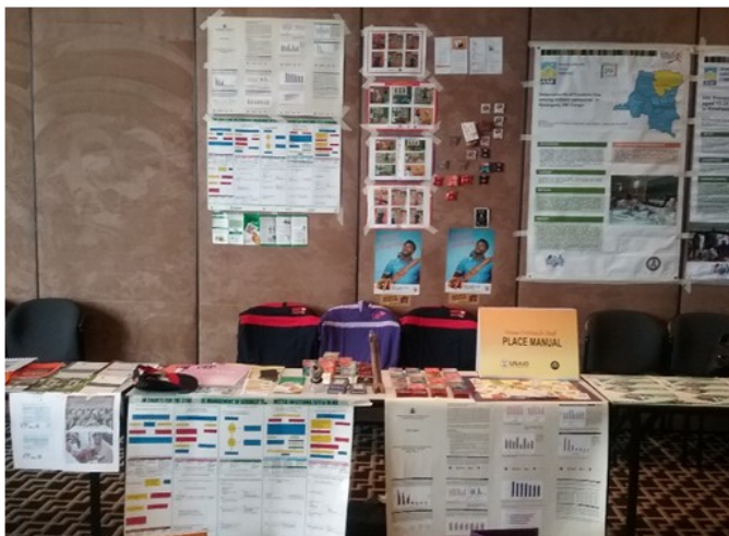
SFH Nigeria's stand displaying the organisation's products and materials during gallery presentation.