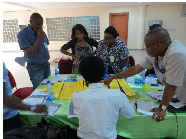
Participants from Cross River state deliberating on their group task.