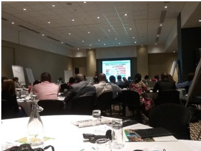
Cross section of participants at the meeting.

The meeting ended on a high note with countries represented drawing up plans of action for individual projects and their wider PSI affiliated organisations.