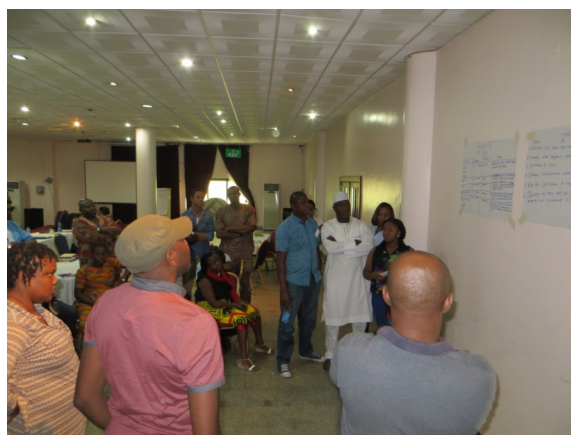
Group presentation on implementation strategies aimed at achieving the 90-90-90 UNAIDS targets.