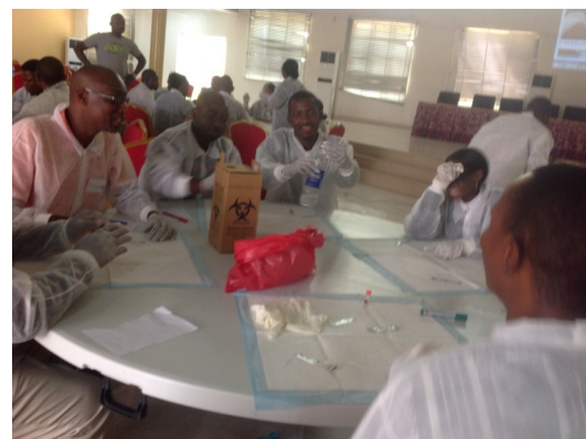
Participants setting up for practicum.