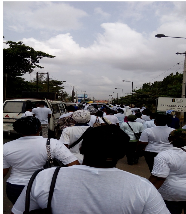
Supporters on the WAR trail in Lagos