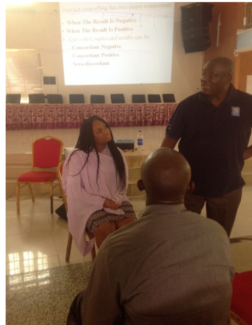
Participants in a role play session on counseling guided by the trainer.

The trainings were conducted by national Master trainers and observed by representatives of the Federal Ministry of Health to ensure modules used were guided by nationally approved curriculum. Participants who successfully completed the training and met all requirements were given certificates of completion.