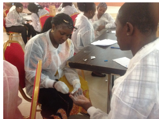
Putting theory into practice.