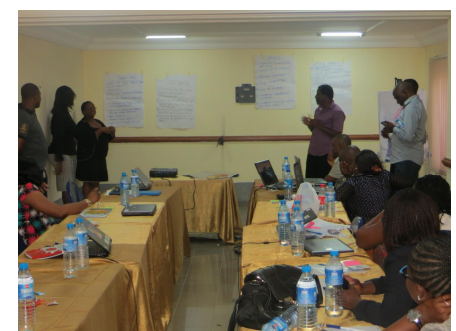
Participants during a Team Building session.