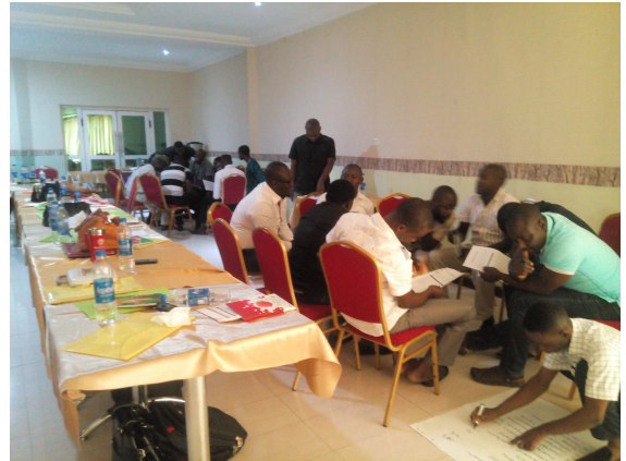
Group tasks during the training

Go to www.pepfar.gov/press/2011/157860.htm to read more.