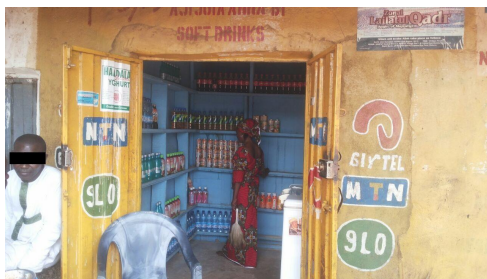
Binta's Shop in Kaduna State

Low self-worth, lack of formal education and limited economic empowerment opportunities are some of the factors that make young women particularly vulnerable to HIV infection in Nigeria.