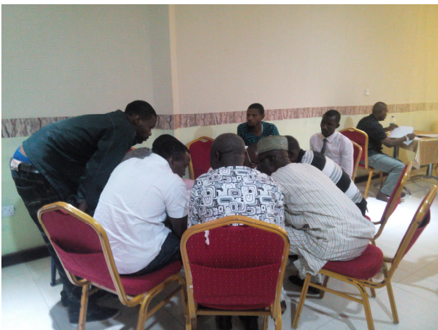
Participants brainstorming as a group during a breakout session.