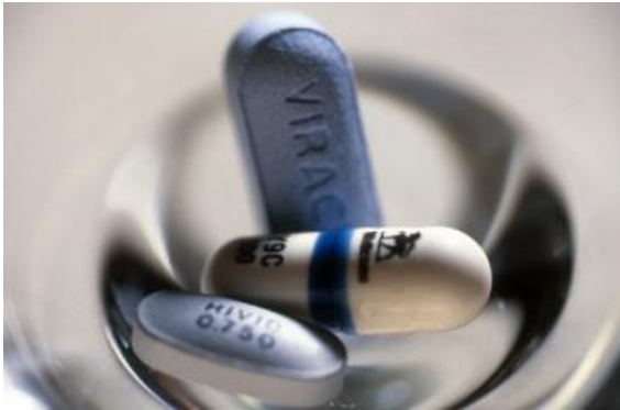
Three-drug cocktail to treat HIV: retrovir (AZT), hivid (DDC) and viracept (Nelfinavir).

Currently, many countries including the UK and most of Europe defer treatment for HIV positive individuals until their CD4 count (a measure of the functionality of the immune system) is 350 cells/mm 3 whereas in the