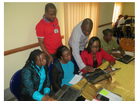
Participants in a team working on assigned task..