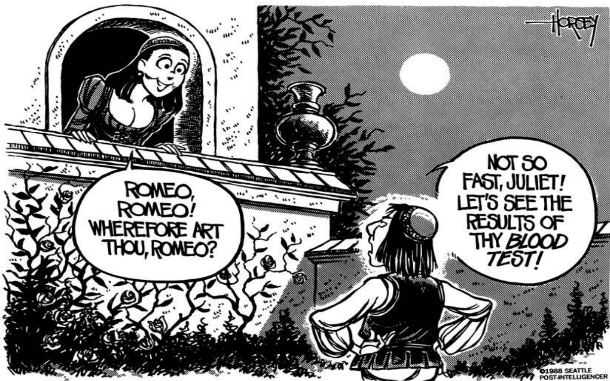
DAVID HORSEY The Seattle Post-Intelligencer USA