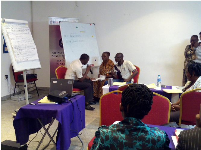
Participants simulate couple counselling.