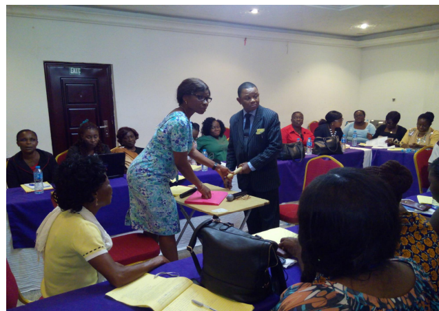
Participants demonstrate physical examination of the male genitalia.