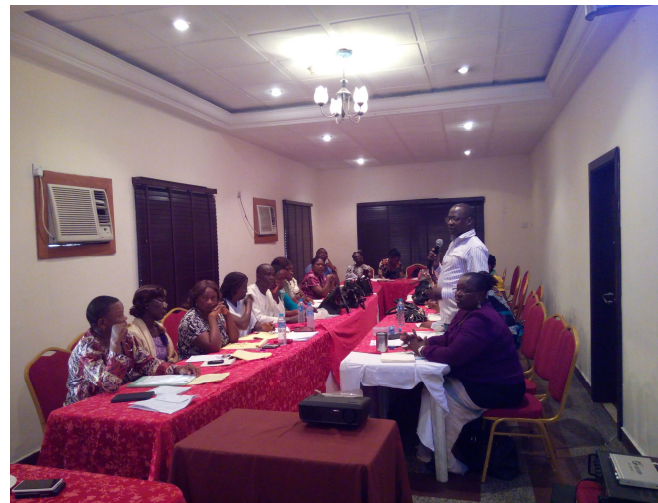
One of the participants at the training making a contribution.