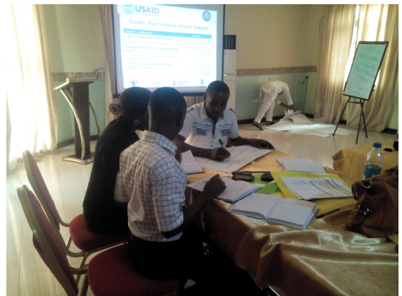
More group tasks.