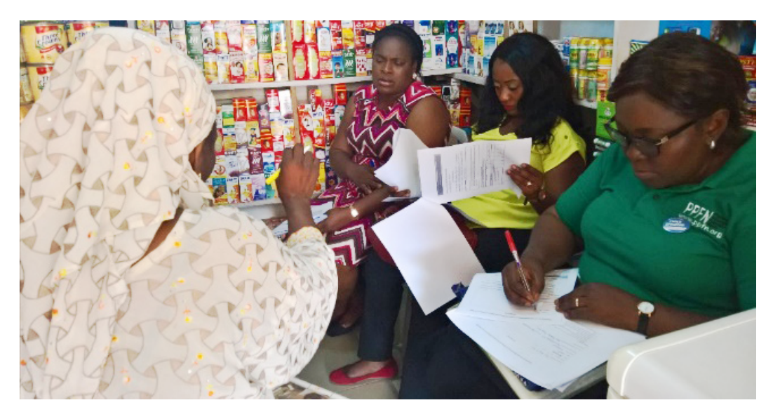
The team from the State discussing with a PPMV during the ISSV in Lagos