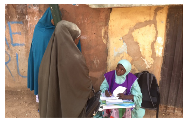
IPCA issuing referral card at Angwan Dora, Kaduna North

They will also explore the use of social Media - Facebook, Instagram, twitter and WhatsApp to send regular messages to the youth about healthy living and making great life choices. Young girls are also linked to SFH "9galnow" interactive platform on Facebook where they can send private messages on sexual and reproductive issues and get prompt feedbacks from trained counsellor, while those that require family planning services are referred to appropriate facilities.