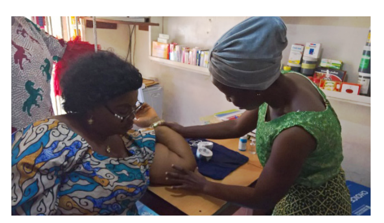
A trained Nurse (Tier2 PPMV) demonstrating her skills in insertion

As part of efforts to strengthen quality of services, the project commenced Integrated Supportive Supervision (ISS) involving relevant stakeholders during the quarter. In Lagos, a total of thirteen (13) facilities were visited within the three days of the activity in Alimosho LGA, 2 of which were tier 2 PPMVs, 1 CP and 10 Tier 1 PPMVs. ISS team included staff from Lagos State Ministry of Health (LSMOH), PCN and the State Primary Healthcare Board (LSPHCB).