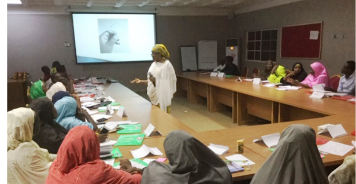
PPMV Tier 2 Training in Kaduna

The IntegratE project trained 38 Tier 1 (Non-Health trained PPMVs) and 48 Tier 2 (Health trained PPMVs) in Kaduna State and 18 Tier 2 PPMVs and 42 Tier 1 PPMVs in Lagos within the quarter. This brings the total number of trained Tier 1 PPMVs (Non-Health trained PPMVs) to 320 and the Tier 2 (Health trained PPMVs) to 179.