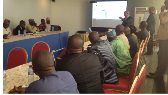
Cross section of PCN directors and staff during the OCA Session

As a first step towards strengthening the capacity to effectively monitor and supervise the PPMV in the tiered accreditation system, the IntegratE project supported the Pharmacist Council of Nigeria (PCN) in carrying out an Organizational Capacity Assessment using the National Harmonized Organizational Capacity Assessment tool (NHOCAT).