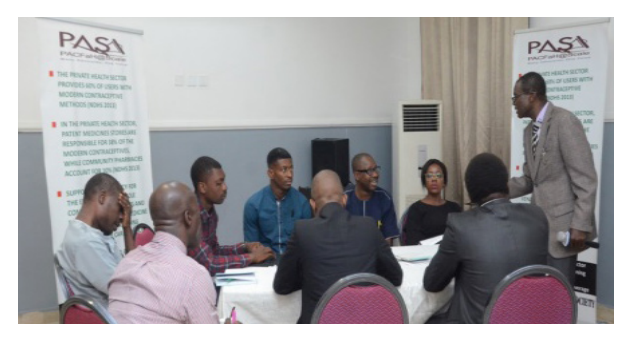
Stakeholders meeting to develop a road map for expansion of APML

The Pharmaceutical Society of Nigeria Partnership for Advocacy in Child and Family Health (PSN-PACFaH) convened the first stakeholders meeting to review the Approved Patent Medicines List (APML) to reflect the commodities expected to be stocked by each Tier of the PPMVs in line with the Tiered accreditation system.