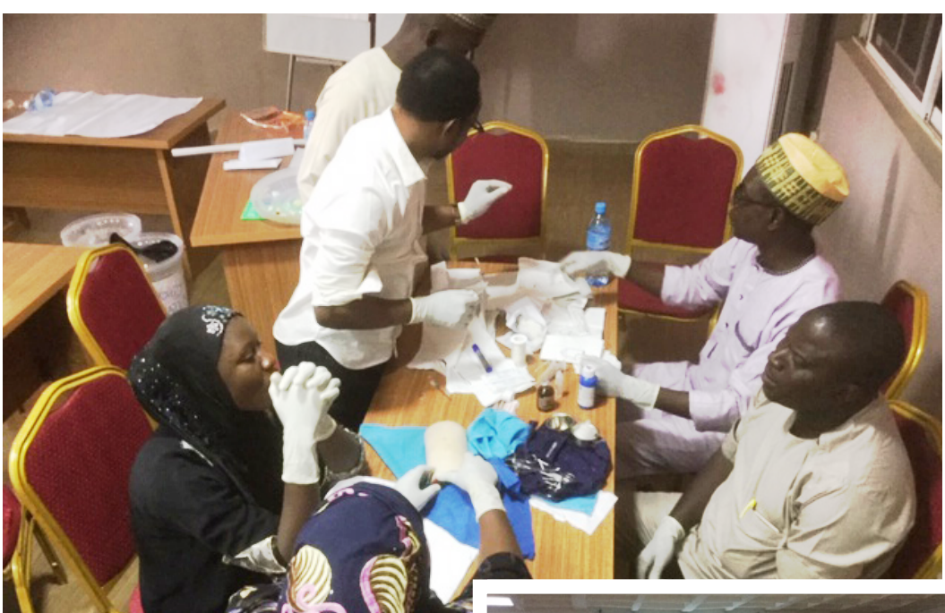
Practical demonstration of implant insertion using arm model during Tier 2 PPMV training in Kaduna