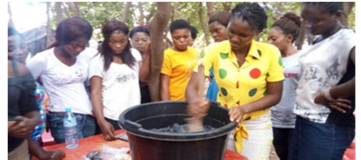
A change influencer Session during Skills to Health training

Our skills to health program under the GF-HIV strategy has reached over 600 high and higher risk AGYW with skills such as soap making, baking, antiseptic production, cosmetic application, production of bead jewellery, interior decoration, amongst others.