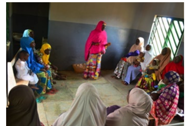
Our A360 programme facilitator moderating a session during an interactive session for Matasa Matan Arewa at our safe space in Kaduna