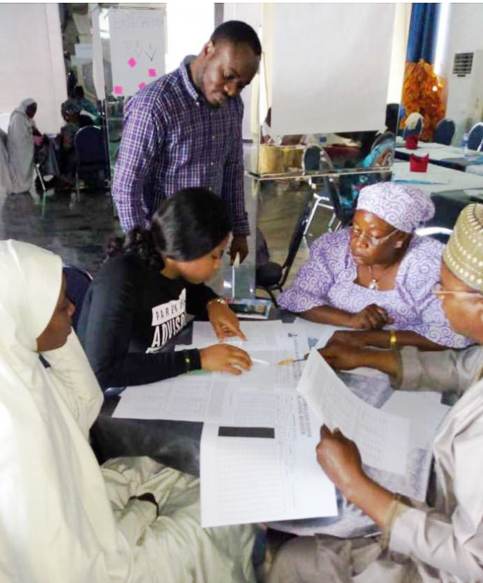
Project staff mentoring of PPMVs

..... “I now know the values that inform the way my son behaves, and I now understand how to deal with him in a friendly manner. For the first time in a long time, my son prostrated and acknowledged his wrongdoings. If I have learned this a long time ago, I wouldn’t have lost him to evil vices”.