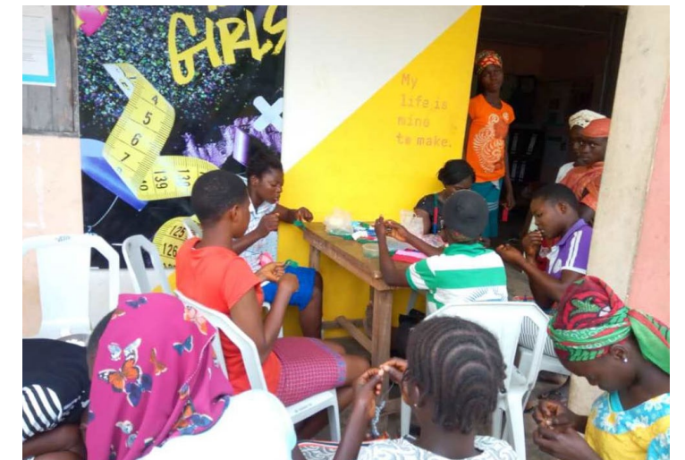
Hands on skill acquisition training for beneficiaries of the 9ja girls programme