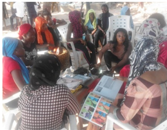
A change influencer (CI) Session at Bwari and Abuja municipal area councils

The target group for these interventions are adolescent girls and young women (AGYW) aged 15 - 24 years.