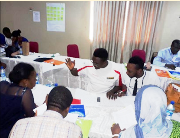
A training session for community pharmacists

In 2018, the project improved the capacity of Patent Proprietary Medicine Vendors (PPMVs) and Community Pharmacists (CPs) services to youth in Lagos and ICD station. A total number of 16 trainings were conducted for 396 health providers. All providers were taught to provide a basket of family planning interventions to youths and adolescents in a youth-friendly fashion. All providers engaged in values clarification training exercises.