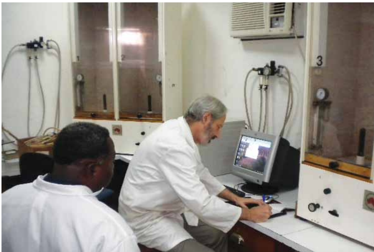
Recalibrating the testing machines at the FMOH / NAFDAC Laboratory. All lots of SFH condoms are tested to ensure they meet international standards before nationwide distribution