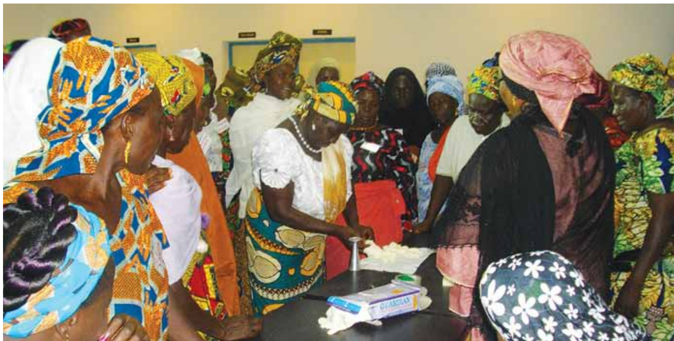
Traditional Birth Attendance (TBA) training in Gombe State

age of 72,360 employees out of which 1,447 referrals were carried out for counselling and testing services.