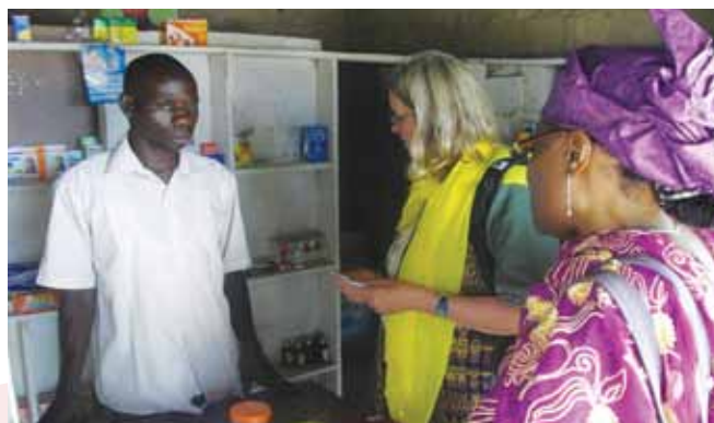
Meeting wit the PPMV in Gombe State

The integration of sales into all programme areas was a critical factor in the company's success of exceeded sales targets for the majority of products in 2010. With anticipated improvement in product stock out, product distribution for the New Year 2011 promises to be more robust as the field continues to augment sales activities.