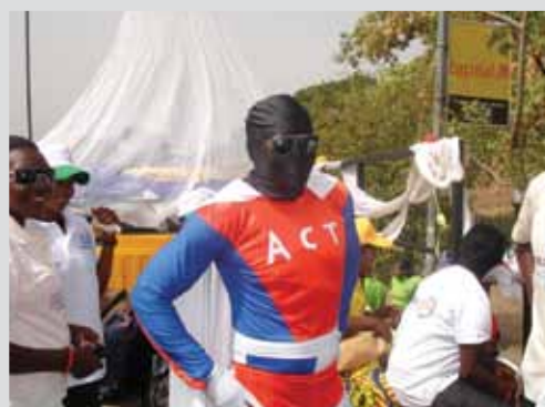
ABOVE: Acting Minister of Health flags off the 2010 World Malaria Day Rally event in Abuja on April 25th. LEFT: A human animation of the Artemisinin-based Combination Treatment (ACT) display at WMD event.