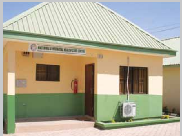
Pictures from the Maternal and Neonatal Health Care Project in Gombe state