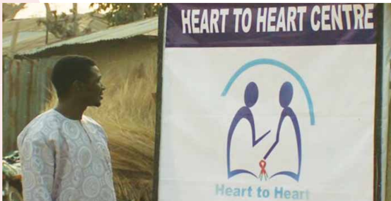
Heart to Heart sign post in Wudil, Kano State