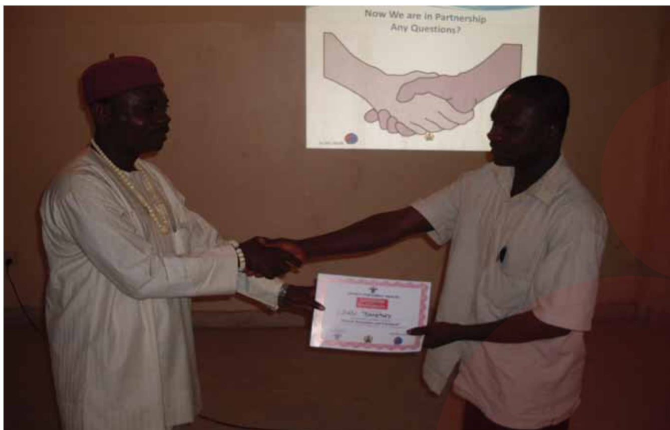
The Chairman of NAPPMED, Kogi State chapter presenting a Patent Medicine Vendor with his certificate after training of PPMVs in Lokoja, March 30th 2010