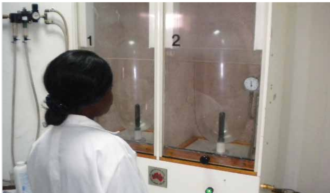
Condom testing at the FMOH/NAFDAC laboratory in Lagos

The programme reached 1,830 peers (1,417 males and 413 females) with Be Faithful messages using the MPP approach. In addition, SFH in collaboration with senior officers of the Nigerian Prison Service conducted a field assessment visit to five Nigerian prisons located in Benin, Owerri, Kano, Lagos, and Abuja.