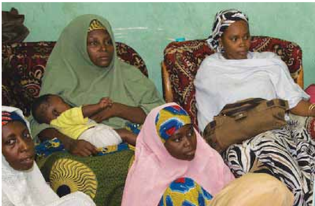
Briefing FOMWAN officials about the MNHCP in Gombe State

A call centre (MNH hotline) was constructed, equipped, and staffed during the reporting period. Ten call centre agents have been trained (five are qualified and experienced nurse/midwives). They commenced work in September 2010. The Executive Governor of Gombe State, represented by the Deputy Governor, commissioned the Centre in November 2010. So far 2,105 calls have been made to the call center by women, men and families.