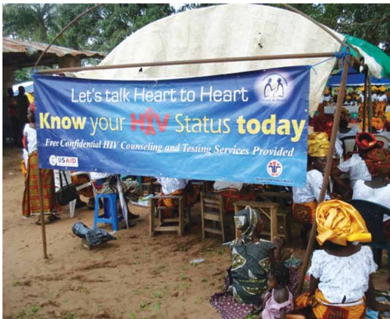
Women at the HIV open community August meeting, South Eastern Nigeria

tion manual, Information Education and Communication (IEC) materials and Behavioural Change Communication (BCC) strategy for Male members of key target groups (KTGs).