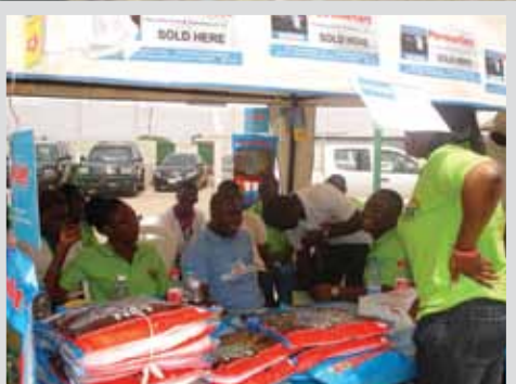
ABOVE: A beneficiary displays her hung LLIN received during the free LLIN distribution in her state. LEFT: SFH displays malaria commodities at its exhibition stand during the World Malaria Day event. BELOW LEFT: SFH team set to lead the rally float on World Malaria Day (WMD) 2010