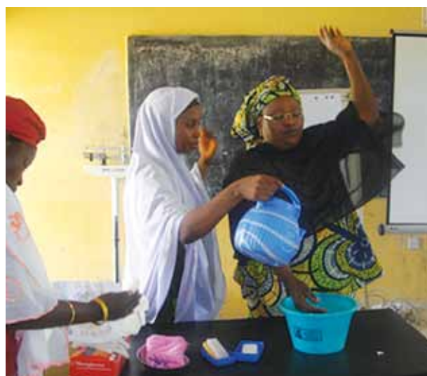
Training TBAs on the processes of glove wearing