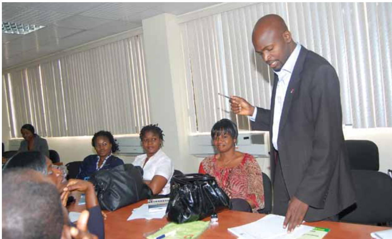
Journalists at the WMD media forum feedback session on April 22nd 2010