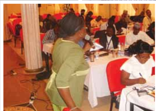
Training Sessions in SFH