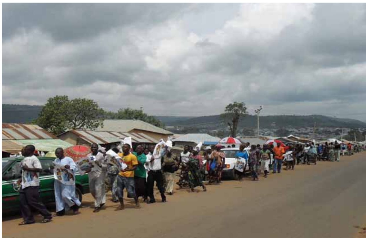
Sensitisation road walk

sales patronage and support from the trade. PPMV training also provided avenue for demand creation and sales.