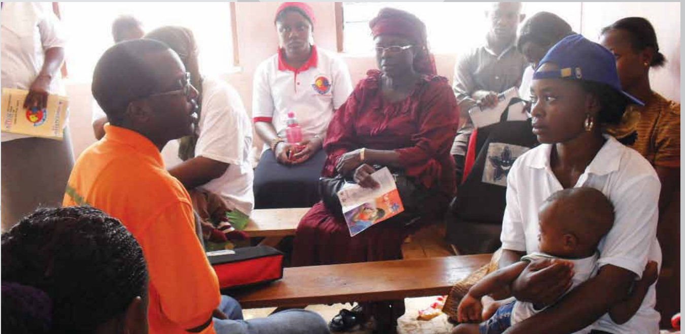
Above: MCH IPC Session