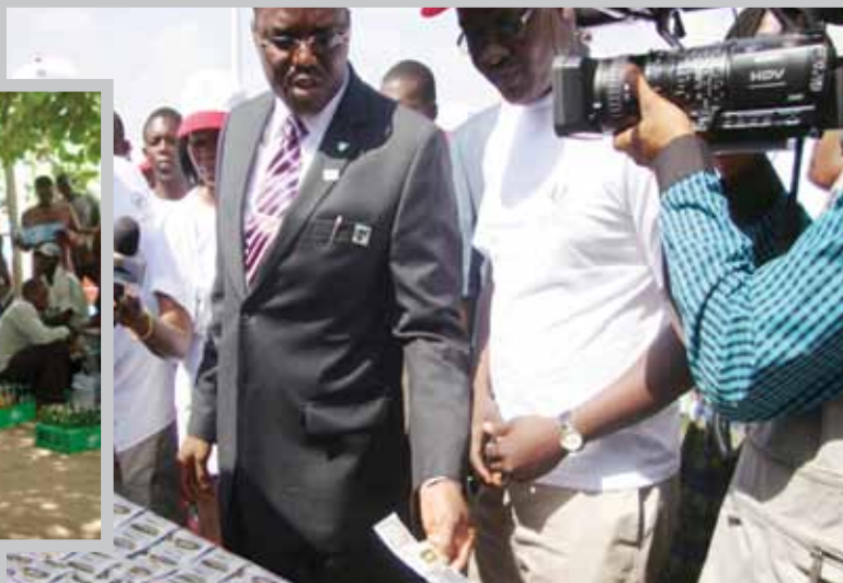
The Honourable Minister of Health, Prof. Christian Onyebuchi Chukwu at the SFH stand during 2010 World AIDS Day