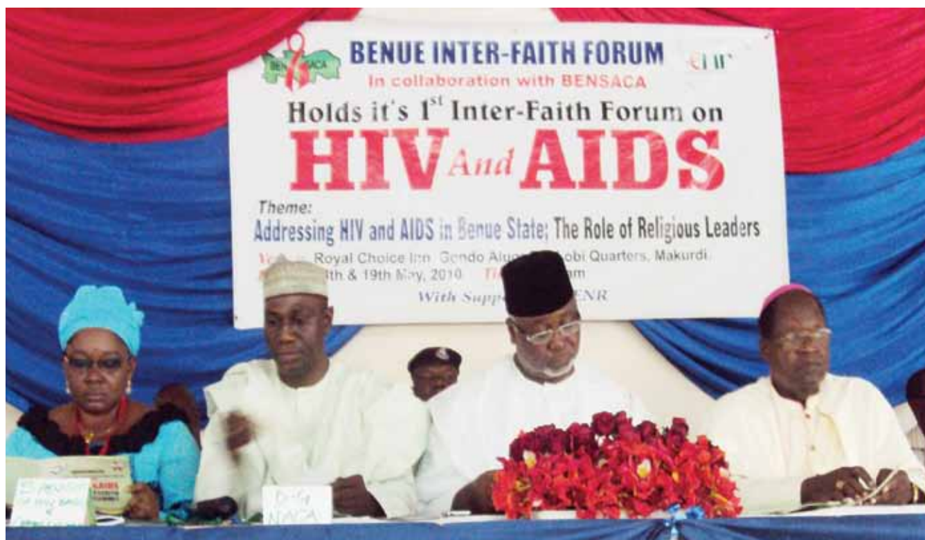
Inter-Faith Forum in Benue State

about 30,743 peers (19,625 males and 11,118 females) with condom related and mutual fidelity messages.