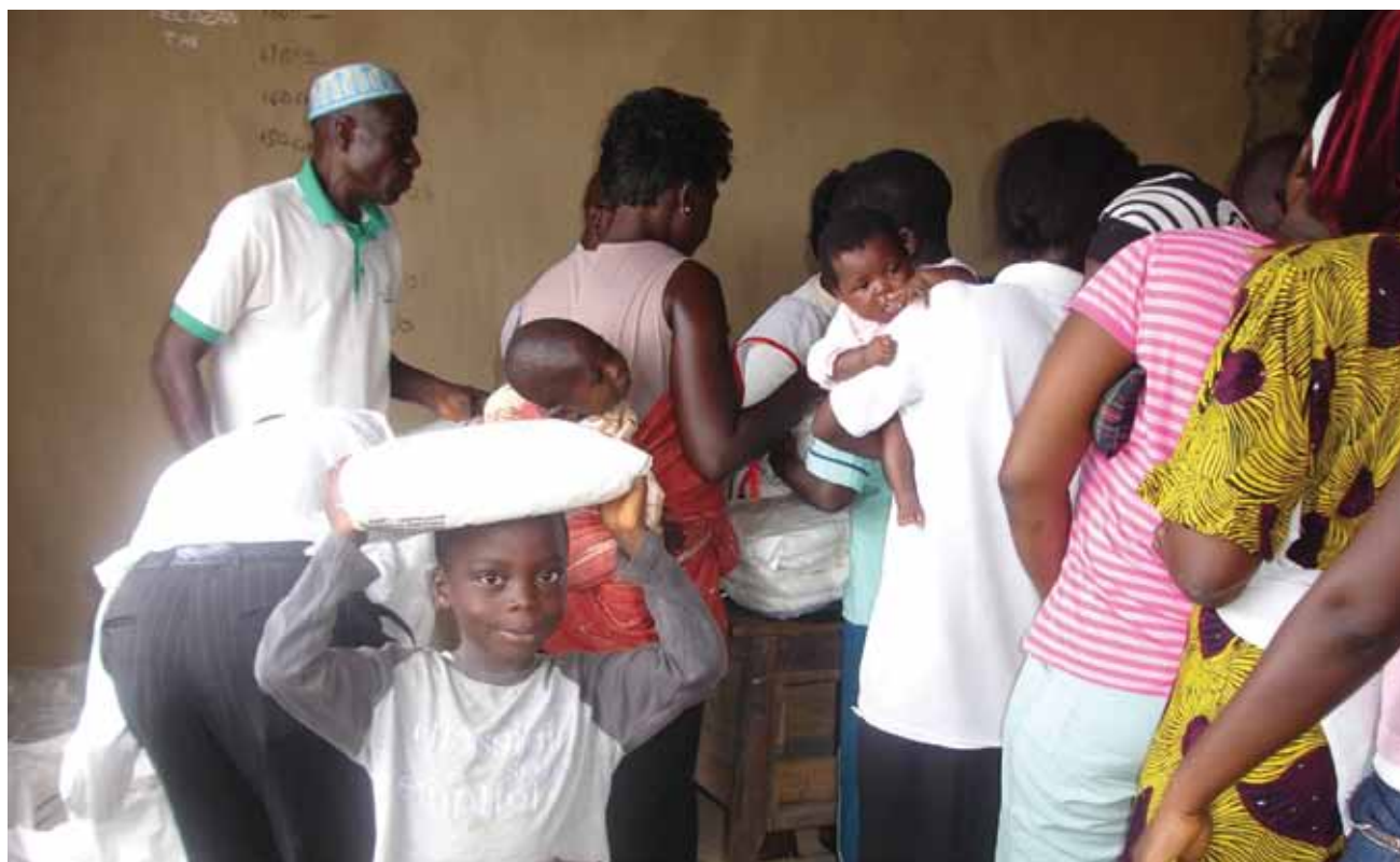
LLIN beneficiaries at the Ogun State mop-up campaign