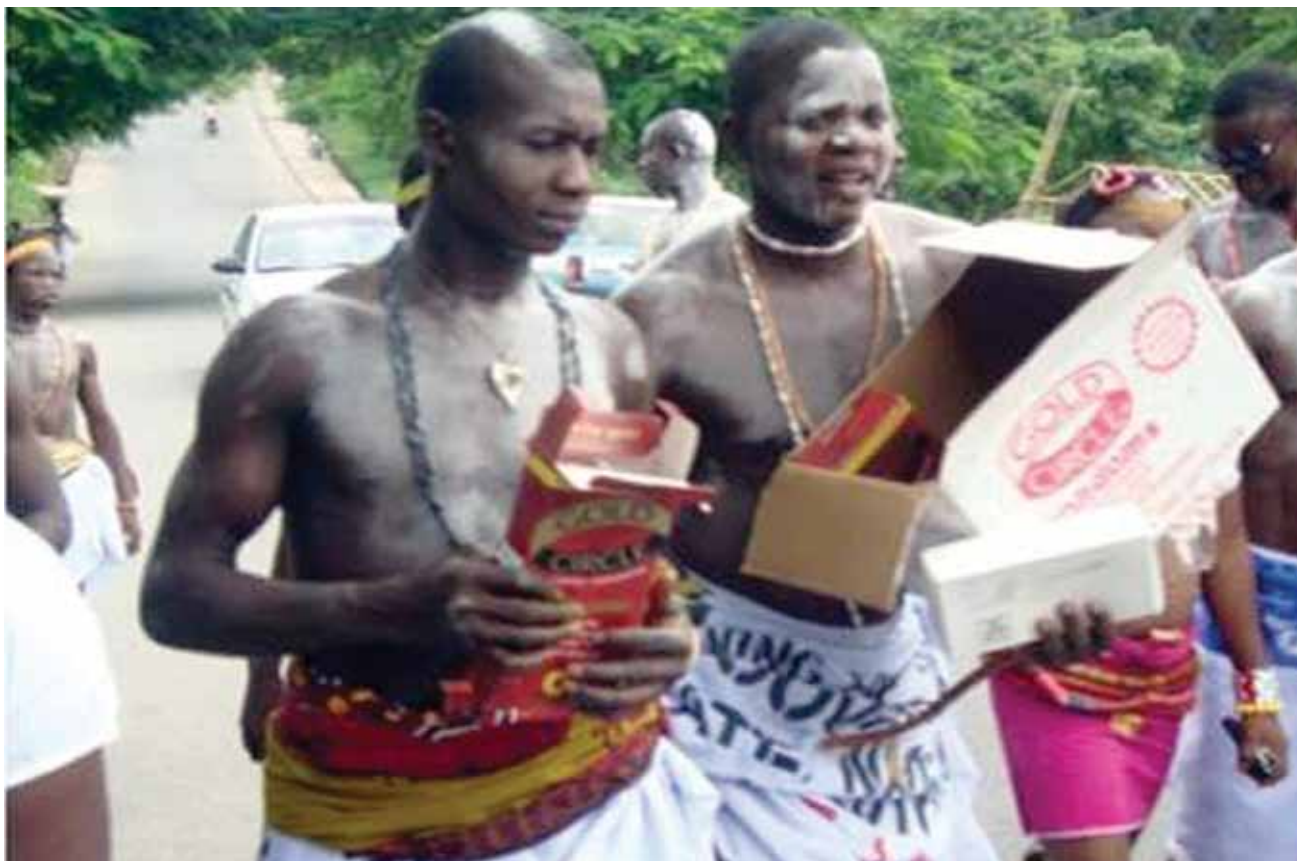
ENR Calabar Carnival

response where there have been significant gaps in available information. It is in this regard that ENR in partnership with UNAIDS is working with NACA to conduct the first ever National AIDS Spending Assessment in the country. ENR supported the training of the NASA Field Assessors and is working with the team in the collection of financial data from the range of stakeholders in Nigeria's HIV and AIDS response.