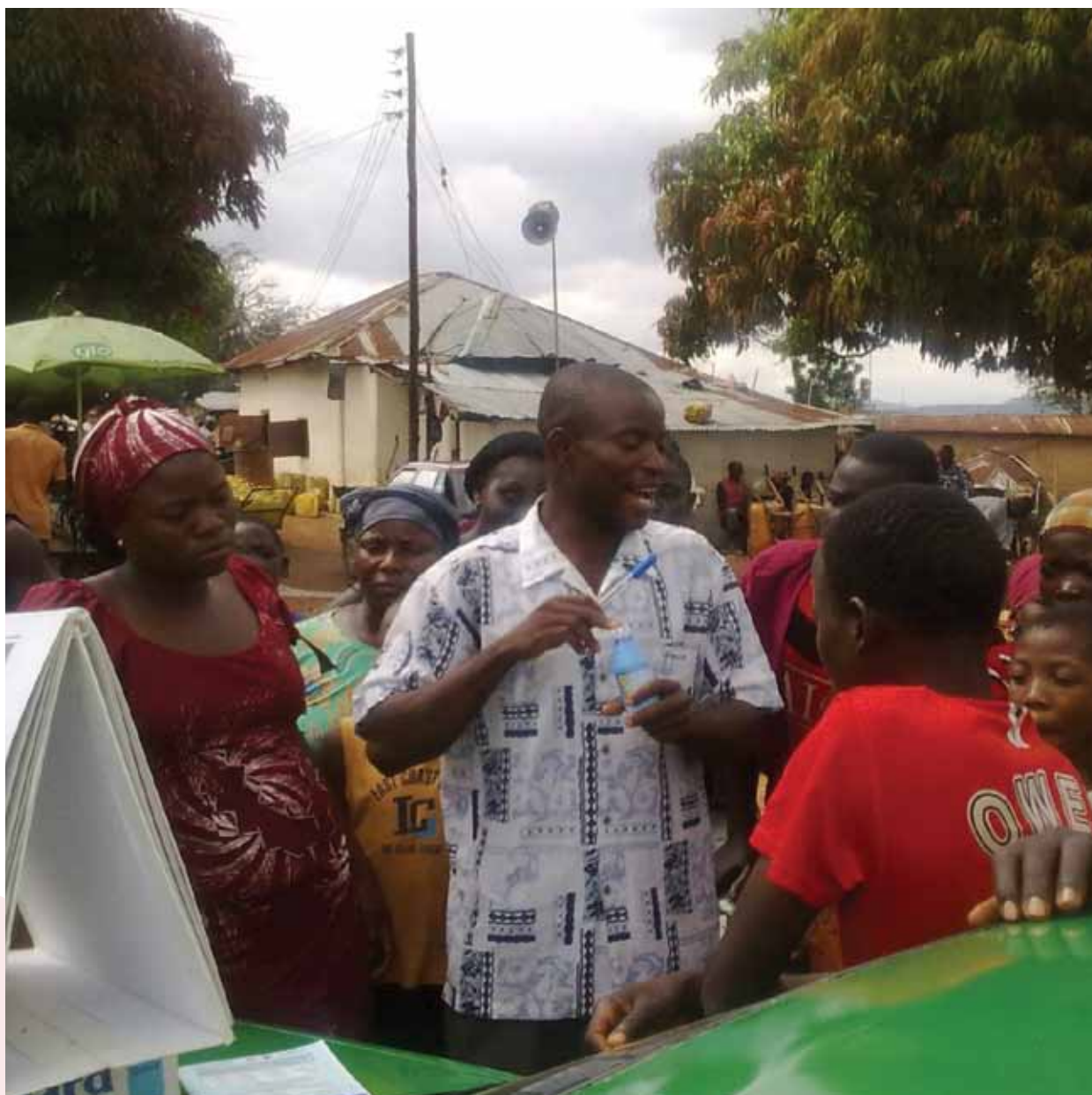
Demonstrating the use of Waterguard® at an IPC session

persons with messages on FC use, benefits and insertion. To facilitate FC uptake and the establishment of non-traditional distribution outlets; 4,231 PPMVs were sensitised within the focal states and given promotional materials for placement in their various service and delivery points.