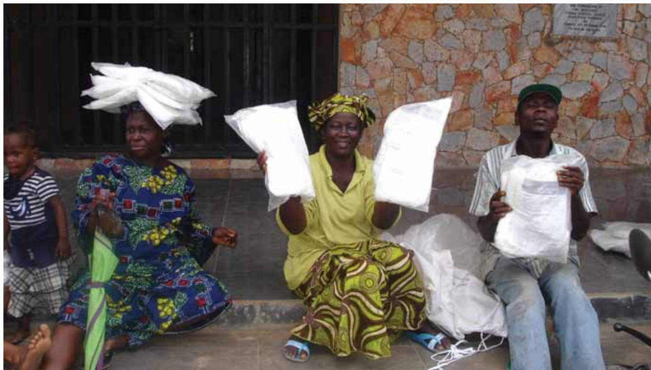
LLIN beneficiaries at the Ogun State mop-up campaign