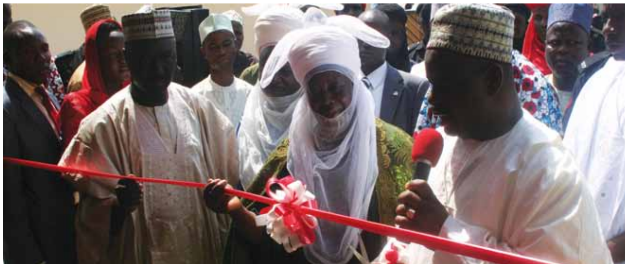
Commissioning the first call centre dedicated to maternal and neonatal health care issues in Northern Nigeria

view meetings for providers in WHP partner facilities and other stakeholders for the project took place in five zones of the country to discuss quality assurance.