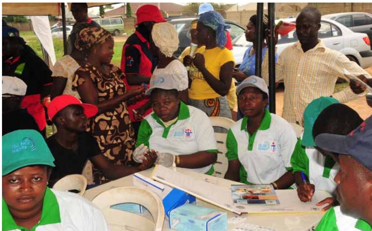
2010 World Malaria day rapid diagnostic testing in session