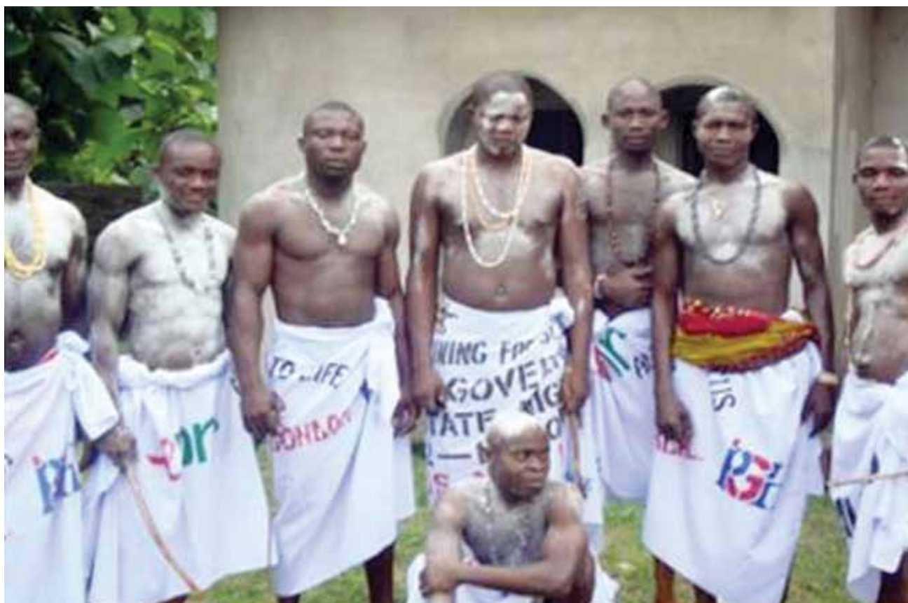
ENR Calabar Carnival