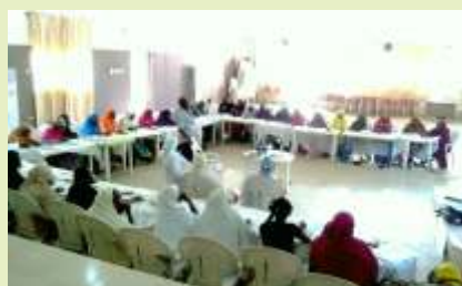
Pix 12: The selected Village Health Worker's (VHW's) Training

The training program was conducted in each of the 11 Local Government Areas. The State primary health care development agency identified trainers from within the system to ensure sustainability. The training approach was a 3 tier strategy which involved the initial training of master trainers; these are senior health officers in the state selected from the GSPHCDA, State Ministry of Health, College of Nursing and College of Health Technology, Local Government Health Officers and SFH Program Officers. This level of training was conducted by engaged consultants from SFH. The trained master trainers then cascaded the training down to selected CHEWS that are to provide supportive supervision to the VHWs. The best performing Master Trainers and Trainers were further trained on facilitation skills for 5days before the training was finally cascaded down to the selected VHWs, which was conducted and facilitated by the trained CHEWS. The adopted training manual and facilitators' guide were used for the training at every level. Table 3 shows the 3 tier training work plan and schedule.