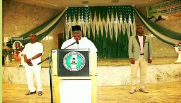
Pix 14: Gombe State Governor delivering his address at the official launch of the scheme