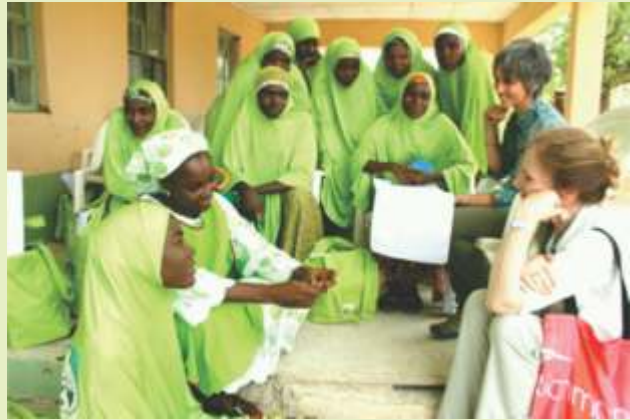
Pix 1: BMGF officials interacting with some VHWs after their initial training

There is wide regional disparities in the maternal, newborn and child health indicators in Nigeria with the North-East and North-West geopolitical regions having the worst case incidences. In the 2013 NDHS, the North East region which house Gombe state has the worst MNCH indices amongst all regions in Nigeria with the highest maternal mortality rate of 1,549 deaths per 100,000 live births , compared to 165 deaths per 100,000 live births in the South West region as well as the national estimate of 576 deaths per 100,000 live births . The region has a persistently high neonatal mortality rate (NMR). In 2013, more than 4 percent of newborns died in the first 28 days, or 43 newborns per 1,000 compared to the national level NMR of 37 in same year. This is quite far reachable from the globally agreed target of 12 per 1,000 by 2030. In addition, the under-5 child mortality rate in the North East region of Nigeria, which includes Gombe State is 160 deaths per 1000 children, above the national average of 128 deaths per 1,000 children.