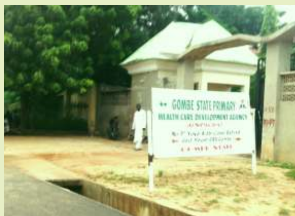
Pix 3: Headquarters of the GSPHCDA located at GRA, Gombe

The GSPHCDA was established in November 2011 and commenced operations in 2013. It is headed by an Executive Secretary who is assisted by several directors in its numerous units. Since inception, the agency with the keen support of development partners such as the Bill and Melinda Gates Foundation has developed and progressively implementing both short and Long term plans to address the identified PHC gaps and needs in the states following an initial comprehensive needs assessment survey. One of the major focus is the Maternal and Neonatal and Child health issues in the state