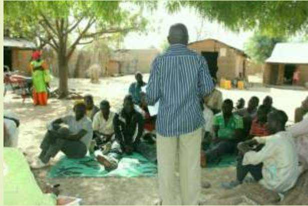
Pix 22: On the right is an IPC session with husbands as influencers

The Executive Secretary stated that plans are on to scale up the scheme to all the Wards and LGAs in the State and the State Government intends to fund the remaining 57 Wards.