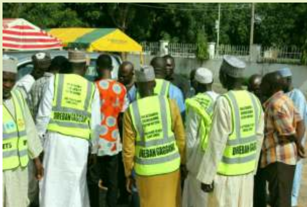
Pix 24: ETS operators after a training session on the left