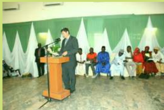
Pix 14b: An official of BMGF delivering his address at the official launch of the scheme