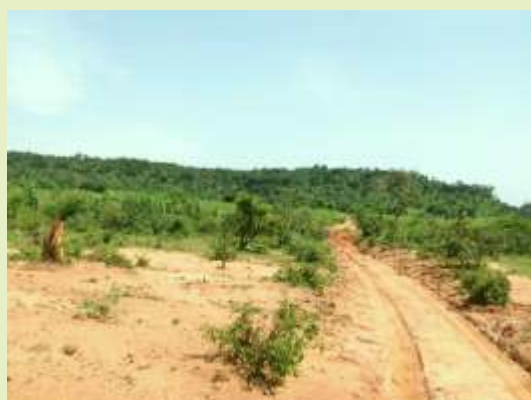
Pix 20: Access road to a hard-to-reach community in Kwami LGA