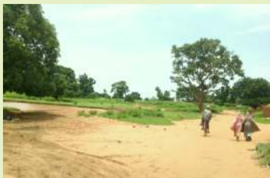
Pix 21: Scene from Dirri Community, Bojude Ward, Kwami LGA