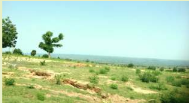
Pix 2: Vast vegetation/flat table land typical of Gombe State

Gombe State was created October 1, 1996. It is located in the heart of the north east region of Nigeria and is the only State that shares boundary with every other State in the region. It shares boundary with Yobe and Bauchi States in the north, with Bauchi State in the west, with Taraba and Adamawa States in the south and in the east with Yobe and Borno States. Dubbed the 'Jewel in the Savannah' for its unique vegetation and expansive flat Savannah land. Gombe state has an area of 20,265 km 2 and a population of about 2.4 million people (2006 National Census). The state has 11 local government areas and three senatorial districts, 114 wards and 14 emirates/chiefdoms.