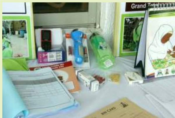
Pix 11: Some VHW work tools and IEC materials that were procured

One of the major deliverables for SFH outside of providing technical support was the procurement and distribution of commodity (supplies and consumables). SFH commenced the procurement and production of the work tools and training materials on time to meet the scheduled time for the VHWs training; these include: data collection tools and VHW Tool kits (Umbrella, flip charts, VHW register, drugs, water bottle, among others). This was necessary to ensure that the training materials arrived at the training venues before the scheduled dates and the utility kits, drugs and job aid materials were ready for distribution to the trained VHWs as soon as the training program was concluded.