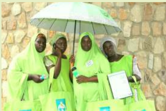
Pix 7: Gombe State VHWs displaying their work kits and tools

In frantic efforts to reduce the high incidence of maternal, neonatal and child mortality rates in Nigeria, health authorities and other major stakeholders have initiated several interventions to address the issues at different levels, using different approach models to ease off bottlenecks, with the eventuality of creating more demand for skilled birth attendance by the women especially those