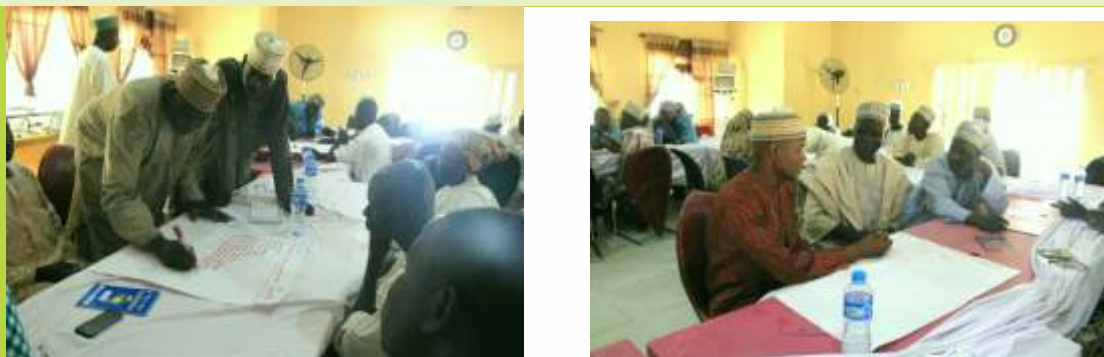
Pix 10: Brainstorming activities during one of the VHW planning meetings

The entire program team and support partners held series of meetings to agree on the program design and develop the implementation work plan. The draft work plan was jointly reviewed with the BMGF team present and adopted. The work plan include major activities such as the Selection criteria; Scope of work for the VHWs; Tool kit (content); Supportive Supervisory Visits (SSVs); VHW stipend and Training programs.