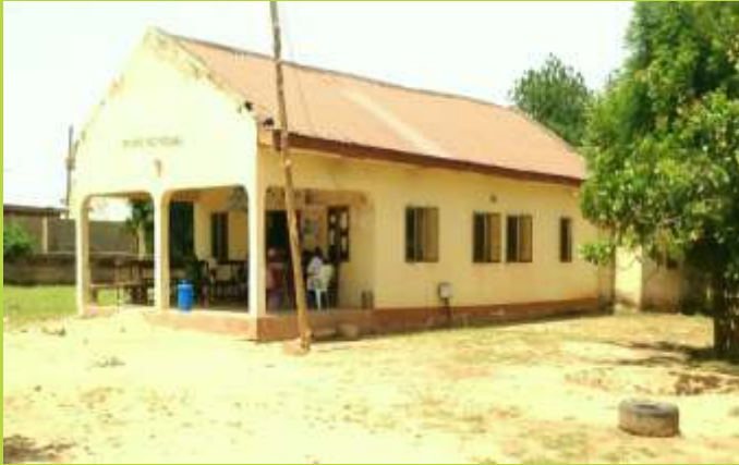
Pix 4: Primary Health Care facility at Tumu community, Akko LGA