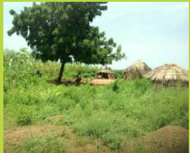
Pix 6: Some rural sights - Bojude community and Bannin-Belle (a hard-to-reach settlement) both in Kwami LGA, Gombe State