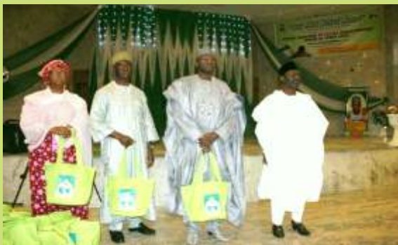
Pix 15: Guests (L) and a group pose by the governor; ES-GSPHCDA; MD, SFH and PD, SFH MNCH-Gates at the VHW launch