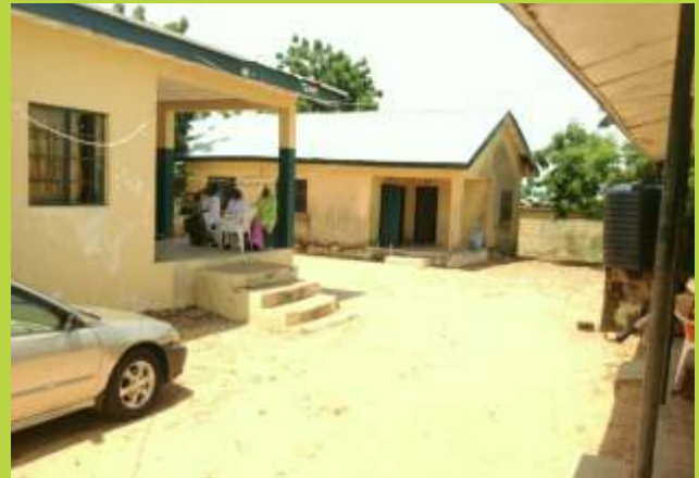
Pix 5: Primary Health Care facility in Akko ward, Akko LGA, Gombe State