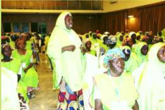
Pix 13: A VHW making a comment during the launch of the scheme

The maiden statewide Village Health Workers Scheme was officially launched in the Gombe state capital on the 13 th October 2016. The occasion was graced by the executive Governor of the state; Alhaji Ibrahim Dakwambo, the entire members of Gombe State Executive and Legislative Arms, Local Government Chairmen and members of the Nigeria Governors forum. BMGF, SFH and BMGF grantees were also represented.