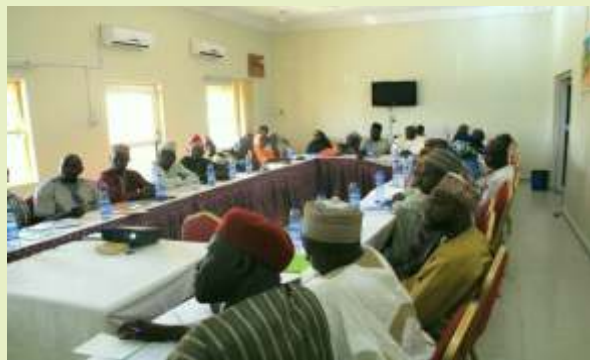
Pix 8: Planning meeting with GSPHCDA officials, SFH and BMGF Grantees.

The team agreed that the initial focus of the program should be MNCH and can later be scaled up to include other health issues prevalent in the state and the intervention scope to cover health promotion for Ante natal care, delivery and immediate post-natal and neonate care, preventive