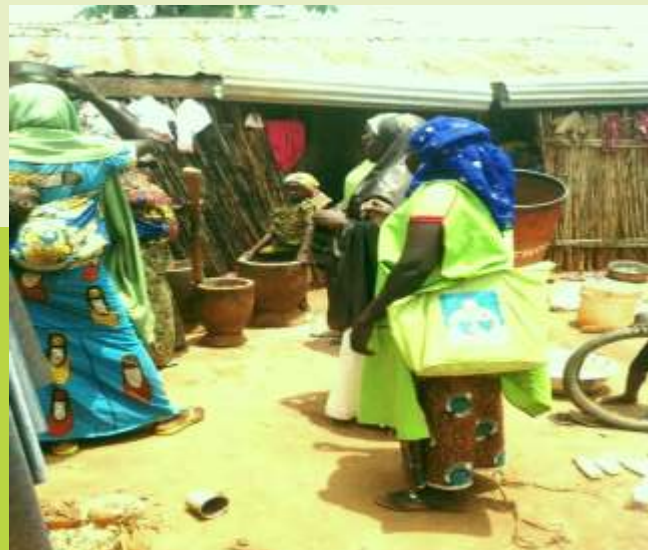
Pix 17: A VHW on duty during a home visitPix

VHW Stipend – The Gombe State Government decided that the VHWs are to be paid a regular monthly stipend of 4,000.00 Naira only as against the 20,000. 00 Naira recommended by the National VHWs Roadmap. This decision was taken so as to ensure and secure the state government's commitment to ownership and sustaining the VHWs program in the state after the exit of BMGF. Meanwhile, the State government agreed to provide counterpart funding for the payment of the agreed stipend in an increasing order starting from 50% to 75% and eventually to 100% at the end of the project after full handover to GSPHCDA.