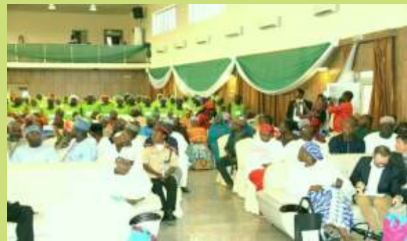
Pix 16: Guest in front and VHW's behind at the official launch of the VHW Scheme