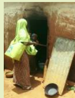
Pix 19: A Village Health Worker on duty in a local community in Gombe State