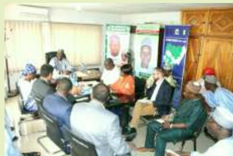
Pix 9: One of the document review meeting with donor

The various developed and adopted draft documents were forwarded to BMGF project team for their input and final ratification. Their Feedback was also reviewed and finally added to the draft documents and materials in a meeting held in Gombe by SFH and relevant directors of GSPHCDA.